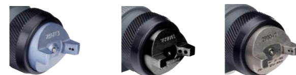
CONVENTIONAL HVLP COMPLIANT

General industry air caps deliver the highest finish quality with small particle size and even spray pattern distribution